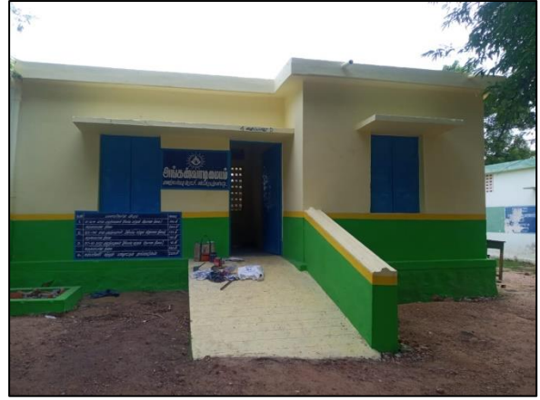
Photos of a renovated Anganwadi in Pudukottai District