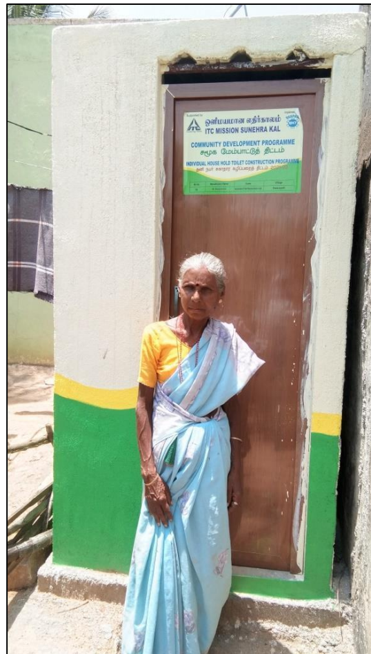
Our IHHTs are very useful for senior citizens. New Anganwadis of FY: 2021-22