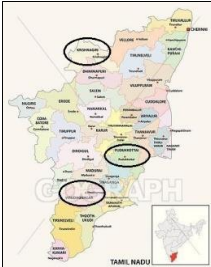
Map of our working districts in TN State Map FY: 2021-22

The below table shows our core villages/Panchyaths/ Blocks where we implemented our Community Development programs;