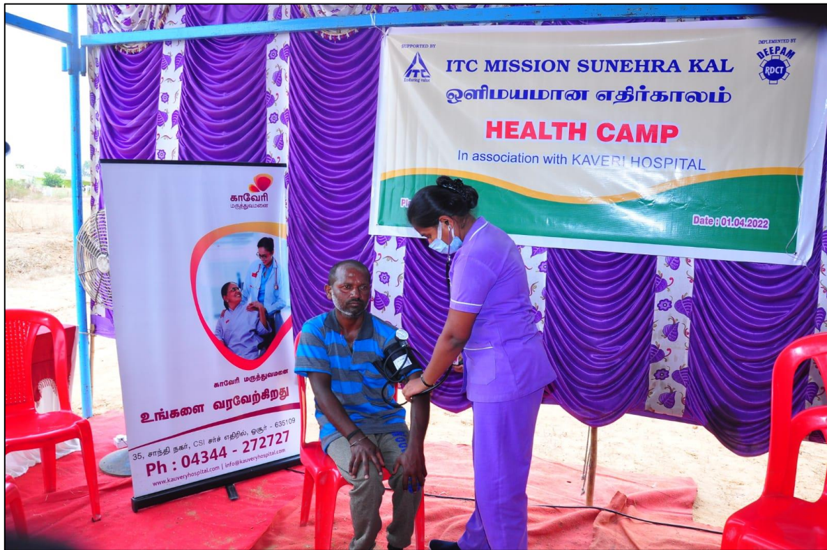
Photo of a health camp conducted in Hosur Block, Krishnagiri District