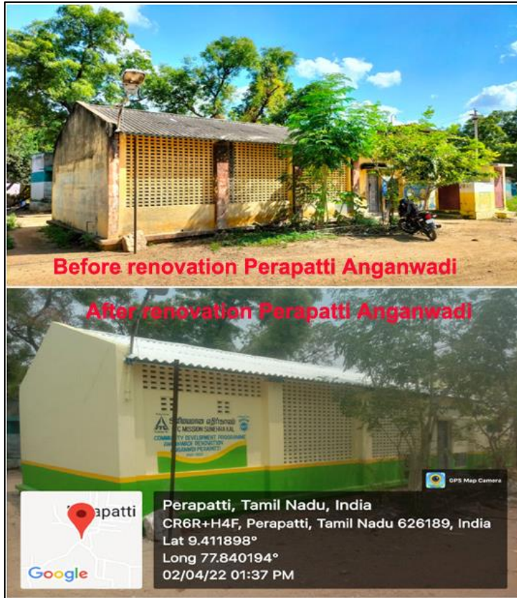
A newly renovated Anganwadi at Perapatti Village, Sivakasi Block