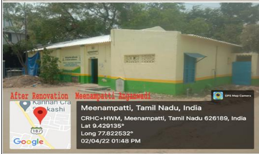
50+ years old Anganwadi renovated in Meenampatti Village, Sivakasi Block